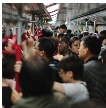
Faster and better cleaning in public transportations.