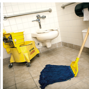
Searching for much more efficient and cost less cleaning with better result.