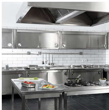
Much more efficient and effectiveness cleaning solution wanted from restaurants, hotels, etc.