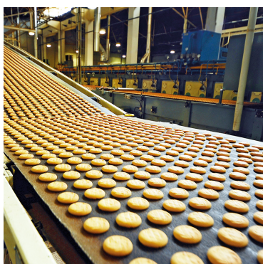
Priority of today's food industry and shops? No contamination - Safety and Sanitation.