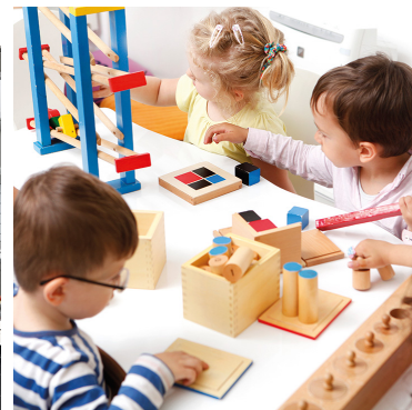
Deep sanitation is required at public buildings, schools, gyms, etc.