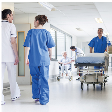
In health care, it needs to be hygienically clean. More sanitation is required at public touch points.