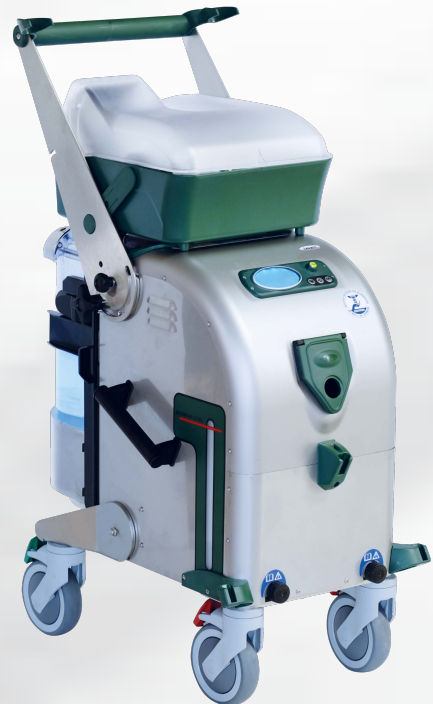
THE BLUE EVOLUTION: