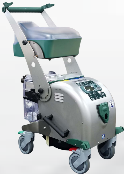
THE BLUE EVOLUTION:

The Blue Evolution is the ideal cleaner for your business. With high levels of steam output, steam pressure and temperature, plus a powerful vacuum - the Blue Evolution can keep cleaning long after other cleaners have given up. Our innovative machine features a robust stainless steel housing, four freely-moving and lockable casters, a patented UV-C light filtration system and a full on-board kit of tools & accessories to tackle any job.